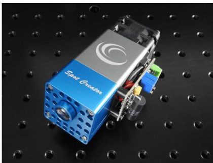
LE-445-6000-SC 6.0 W Blue 445 nm Engraving, Cutting, and Marking Laser